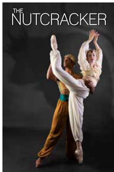
December 8 & 9, 2018 Ruby Diamond Concert Hall 3 Performances